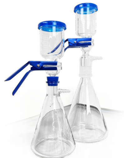
Glass vacuum filter unit