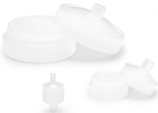
Reusable syringe filter holder