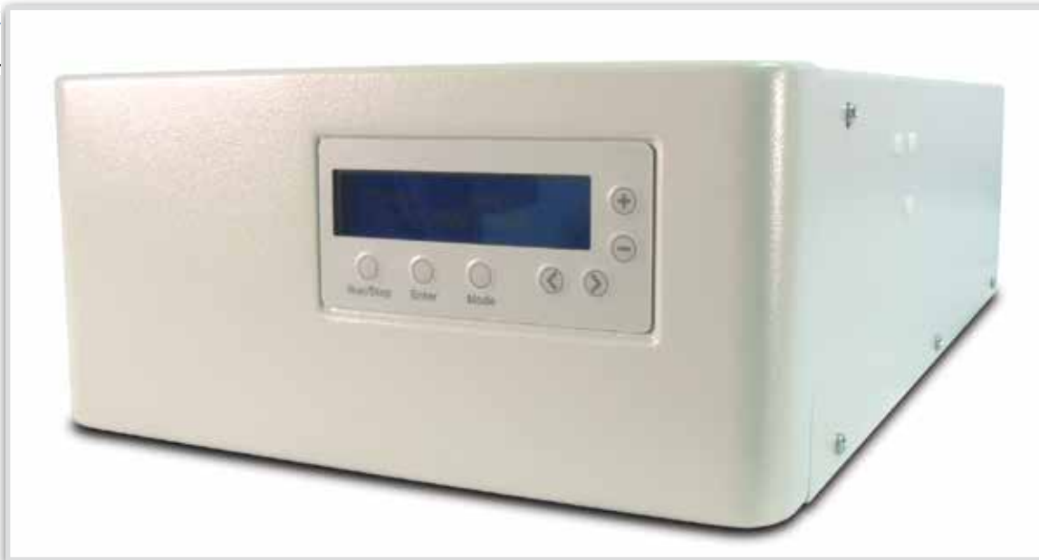
Ultra-High Pressure Pump (18000 psi) for High Throughput HPLC and Column Packing

Instrument Solutions Technology for Your Success!